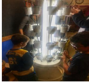
Nutritower is up and running in grade two.

Thank you to the grade 6 classes for the wonderful haunted house that they put on for the school.